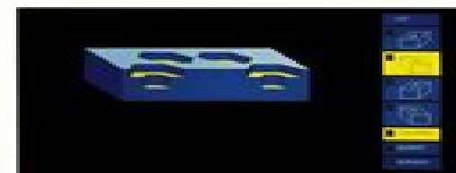
3D- and cross-sectional display.