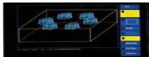
Graphics program test identical to that of the control system.