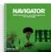
Evaluation and Management for Oncology