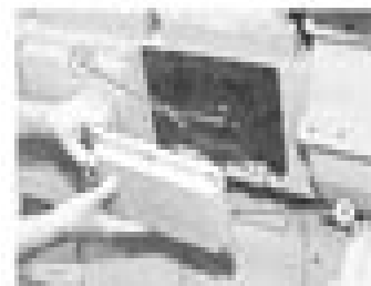
10. TIMING PINS (10) FROM TIMING HOLES 10. Timing pins. 11. Cover.