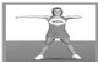
BOW AND ARROW One arm extended to side with other arm bent at elbow in a half "T" motion