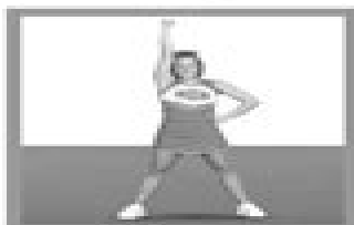
PUNCH One arm extended straight up, one arm on hip, in a fist