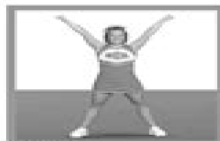
HIGH V Arms extended up forming a "V", relax the shoulders