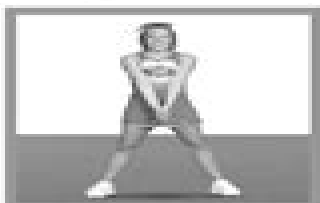
LOW CLASP Arms extended straight down, in a clasp and slightly in front of the body