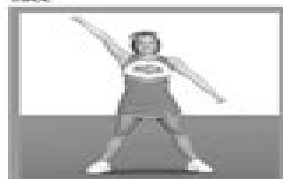
DIAGONAL One arm extended in a high "V" and the other arm extended in a low "V" (Right Diagonal shown)