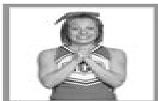
CLASP Hands clasped, at the chin, elbows in