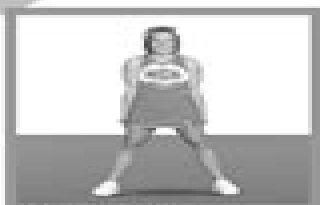
CHEER STANCE Feet more than shoulder width apart, hands down by the side in blades