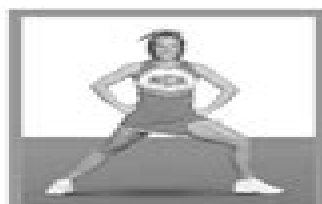
SIDE LUNGE Lead leg bent with the knee over the ankle, back leg straight, feet perpendicular to each other