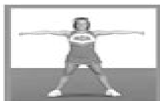
T MOTION Both arms extended straight out to the side and parallel to the ground, relax the shoulders