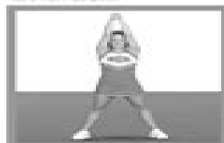
OVERHEAD CLASP Arms are straight, above the head in a clasp and slightly in front of the face