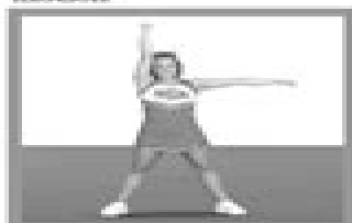
L MOTION One arm extended to the side with other arm extended in a punch motion. (Left L shown)