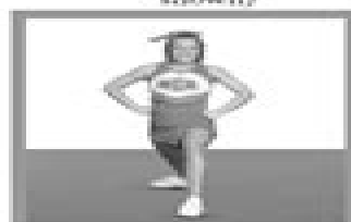
FRONT LUNGE Lead leg bent with the knee over the ankle, back leg straight, feet perpendicular to each other