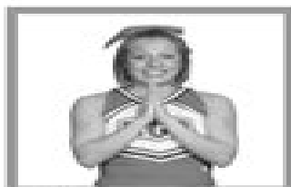
CLAP Hands in blades, at the chin, elbows in