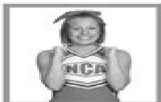
TABLETOP Arms bent at elbow, fists in front of shoulders