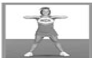
HALF T Both arms parallel to the ground and bent at the elbows, fists into shoulders