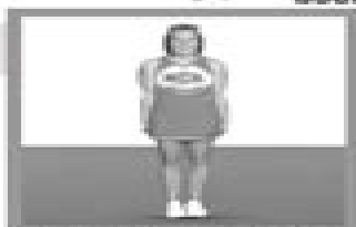
BEGINNING STANCE Feet together, hands down by the side in blades