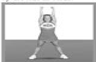
TOUCHDOWN Arms extended straight and parallel to each other, fist facing in