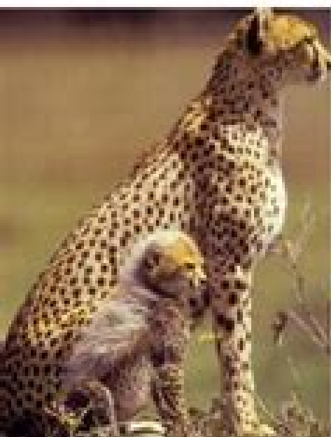
Mother cheetah teaching baby how to survive