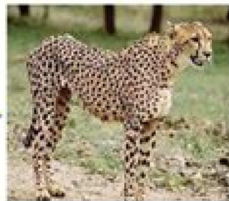
Cheetah fully grown!

Then the whole cycle starts over again! (but only if the cheetah fully grown is female)