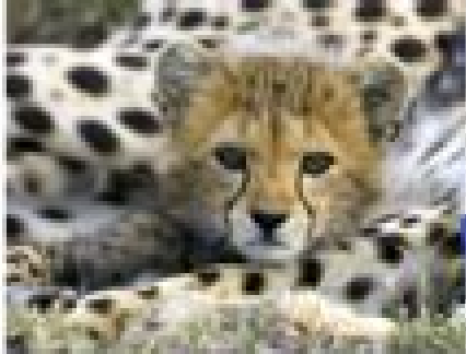
A cute baby cheetah is born!