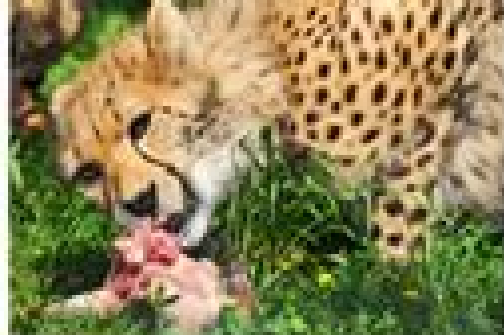
The cheetahs happily eating food