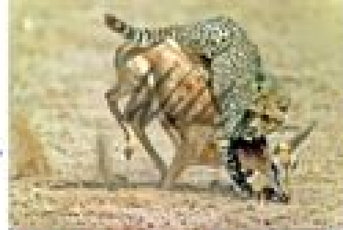
The mother cheetah brings food for the baby