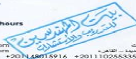
Instructor Ayman Hassan

+201007001050 +201148015916 +201110255335 +201094230011