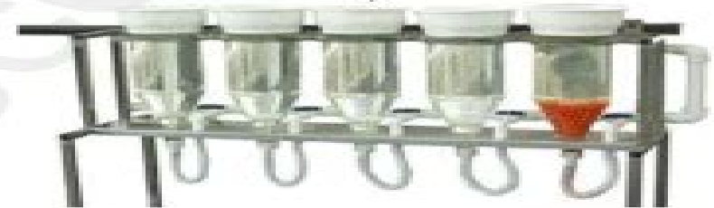
Eggs in hatcheries