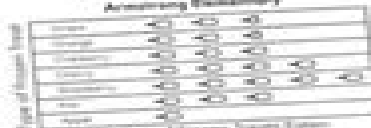
Favorite Frozen Fruit Treats at Arctic Food Bank