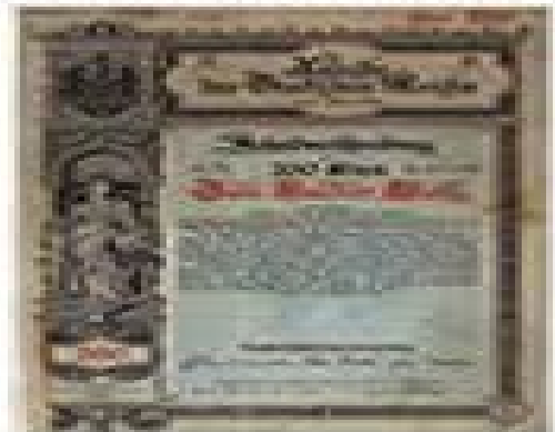
German Reichsbank, 2 1/2% bond 200 mark, LR E, Berlin Dec. 5, 1928. Only one found.