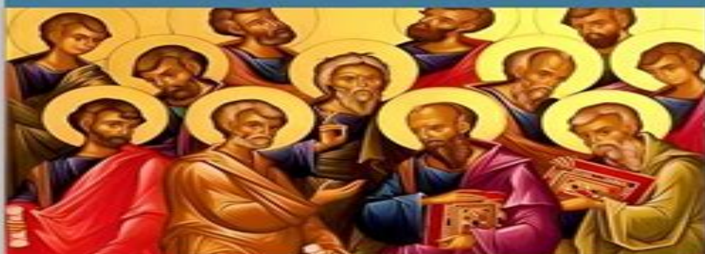
The Twelve Disciples

God dealing with the nation of Israel on the basis of His covenant.