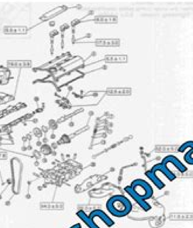
Fig. 10-10 Timing torque

00011 00012 00013 00014 00015 00016 00017 00018 00019 00020 00021 00022 00023 00024 00025 00026 00027 00028 00029 00030 00031 00032 00033 00034 00035 00036 00037 00038 00039 00040 00041 00042 00043 00044 00045 00046 00047 00048 00049 00050 00051 00052 00053 00054 00055 00056 00057 00058 00059 00060 00061 00062 00063 00064 00065 00066 00067 00068 00069 00070 00071 00072 00073 00074 00075 00076 00077 00078 00079 00080 00081 00082 00083 00084 00085 00086 00087 00088 00089 00090 00091 00092 00093 00094 00095 00096 00097 00098 00099 00100