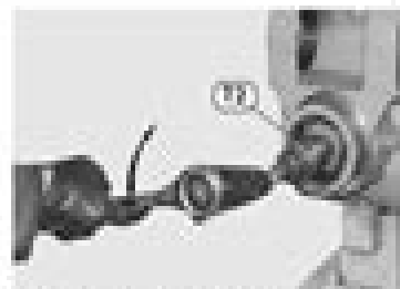
FIGURE 37: STANDARD INPUT FLANGE VERSION Apply Loctite 562 to the thread of the ring nut (2) and screw the nut onto the pinion (8). Torque: 120 - 200 Nm