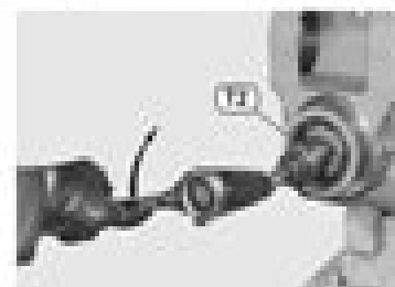
FIGURE 44: FLANGED-GEARBOX VERSION Apply Loctite 562 to the thread of the ring nut (2) and screw the nut onto the pinion (8). Torque: 120 - 200 Nm

Make sure that the guard (4) is securely fastened onto the torque (2) and that it is not deformed.