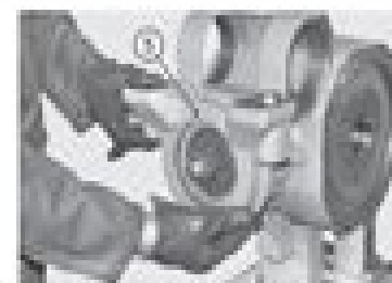
FIGURE 42: Install the swinging support (5).