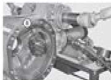
FIGURE 36: STANDARD INPUT FLANGE VERSION Connect the pinion (8) to the bevel (7) (See drawing "T3" page 126 and 168 (See drawing "T3" page 126), connect the bevel (8) (See drawing "T3" page 126) (See special tools in the press and tooth).