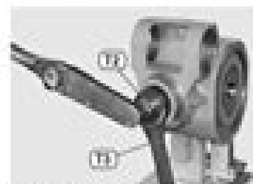
FIGURE 41: FLANGED-GEARBOX VERSION Apply special wrench T3 (See drawing "T3" page 126) to the ring nut (2) and bar nut T3 (See drawing "T3" page 126) to the pinion (8). Lock the wrench T3 (See drawing "T3" page 126) and rotate the pinion using a torque wrench, set to a minimum required torque setting of 500 Nm.

When calculating the increase or decrease in size of stem "10", bear in mind that a variation of stem (1%) of 0.01 mm corresponds to a variation of 50 Nm in the torque of the pinion (8).