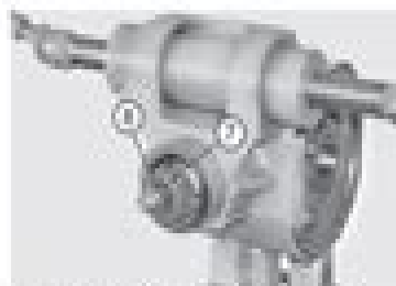
FIGURE 38: STANDARD INPUT FLANGE VERSION Apply Loctite 562 to the thread of the ring nut (2) and screw the nut onto the pinion (8).