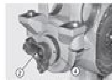
FIGURE 43: Fit the torque (2) complete with the guard (4) and lock (3). For testing the torque (2), use a plastic hammer if necessary.