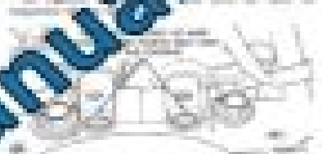
Fig. 20 Front Support Spring