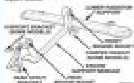
Fig. 17 Front Support Spring