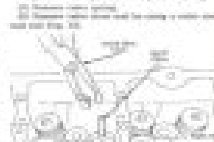
Fig. 24 Front Support Spring