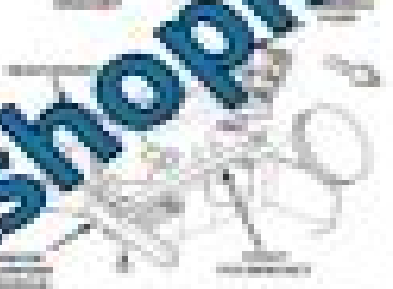
Fig. 19 Rear Support Spring