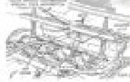
Fig. 23 Front Support Spring