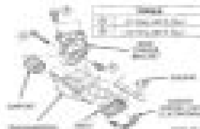
Fig. 18 Rear Support Spring