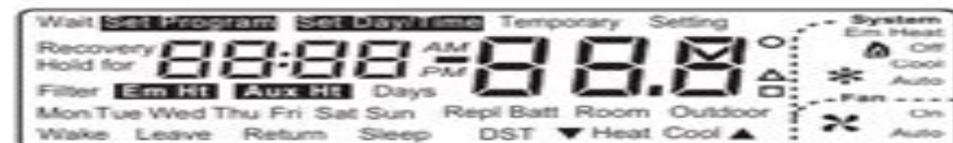
Fig. 11. Display of all LCD segments.