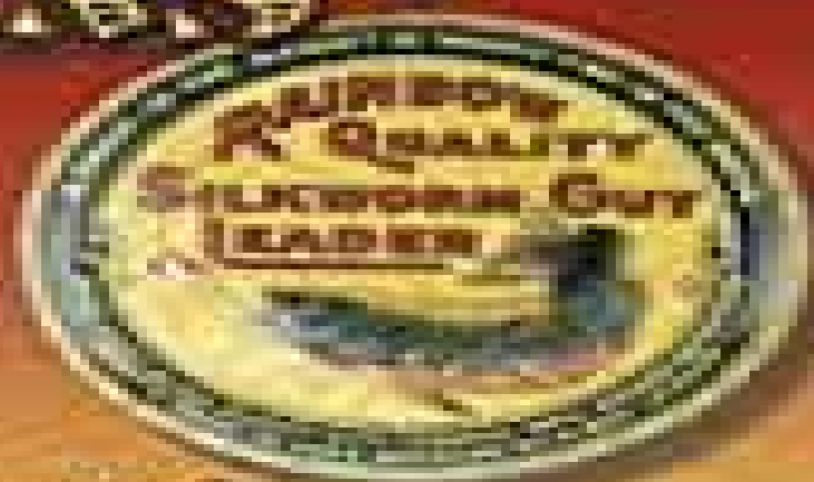
Smalls & Samples