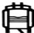
ENGINE COOLING SYSTEM