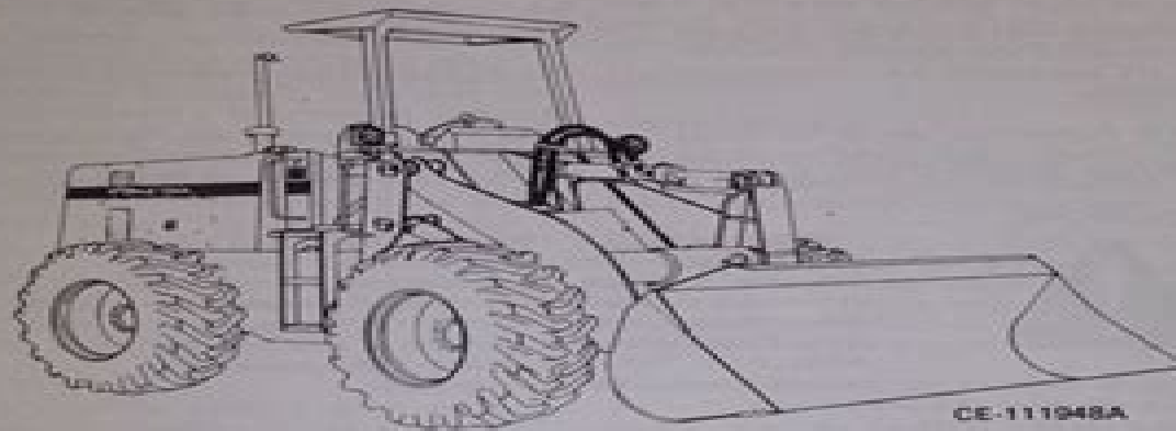
FIG. 1—International 510B Pay Loader