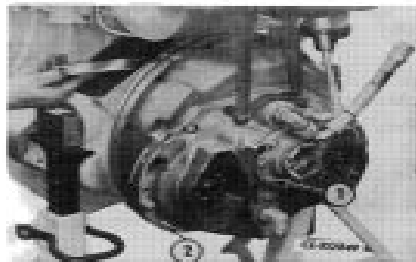
Illustr. 3 Removing the Drive Plate Clamp Strip.

and clamp strips securing the converter drive plate to the flywheel (Illustr. 3). Turn the engine crankshaft to reach all the mounting bolts. One method of holding the flywheel from turning as the bolts are removed is to remove two cap screws at the front of the crankshaft, replace with longer cap screws, then use a bar between the bolt heads.