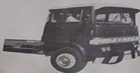
FIG. 2. 1/2 TON