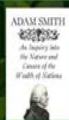
An Inquiry into L...