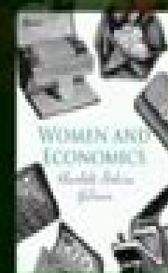
Women and Eco...