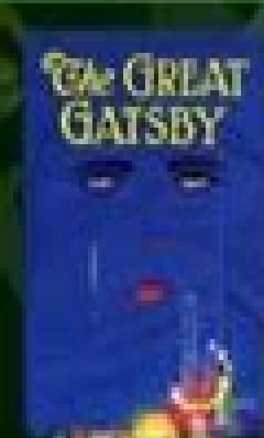
The Great Gatsby