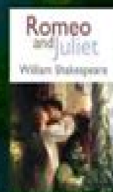
Romeo and juliet