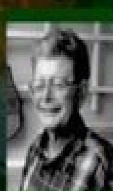
The Valor of Cap...