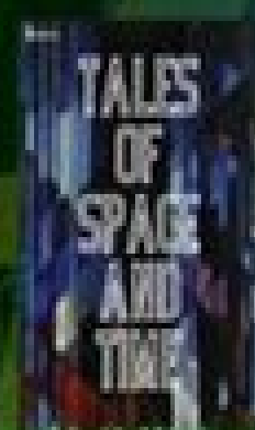
Tales of Space an...