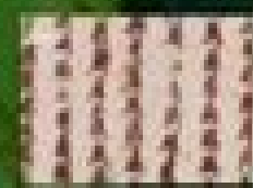
The Book of the Dead