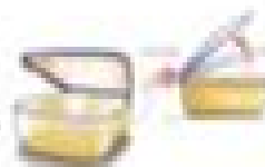
Fig. 7 Exploded view of a mechanical assembly (3D CAD model) showing the assembly sequence. The components are arranged in a way that shows the order in which they should be assembled.

Figure 7 and 7' represent a food container with a long finger and a cylinder with a sliding mechanism that reveals the design. It both indicates the view is moved to the communication, both explore the logic of the system of motion in greater depth.