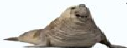
Southern Elephant Seal