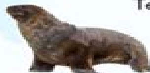
New Zealand Sea Lion