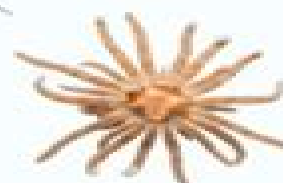
Antarctic Sun Starfish