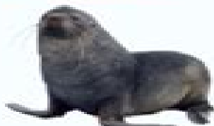
Antarctic Fur Seal