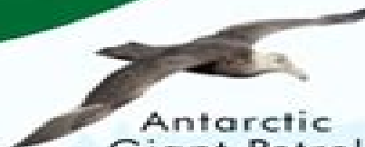
Antarctic Giant Petrel