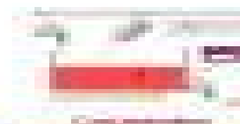
Figure 1: Bomb Calorimeter