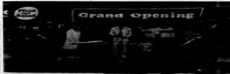
PIZZA INN. The new Pizza Inn is well on its way. Many more and more people are coming. Friday, Saturday and Sunday.

The new Pizza Inn restaurant is holding a grand opening event. The event is scheduled for next week and will feature a variety of promotions and discounts. The Pizza Inn is a popular chain of restaurants and is expected to become a new favorite spot for locals. The grand opening is a great opportunity for people to try the new restaurant and see what it has to offer.