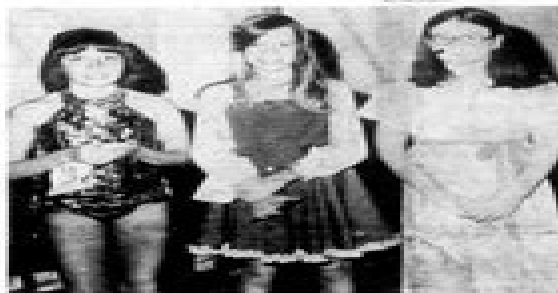
STEPHENVILLE JUNIOR HIGH SCHOOL BAND. The band is well on its way. Many more and more people are coming. Friday, Saturday and Sunday.

The Stephenville High School band and the Stephenville Junior High School band have both won sweepstakes awards. The awards were given for their excellent performance at a recent competition. The Stephenville High School band won first place and the Stephenville Junior High School band won second place. Both bands are proud of their achievements and will continue to work hard to improve their skills.