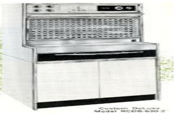
Custom DeLuxe Model RCDB-630-2