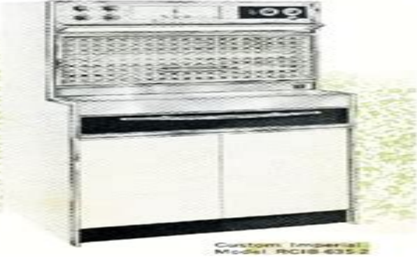
Custom Imperial Model RCIB-635-2