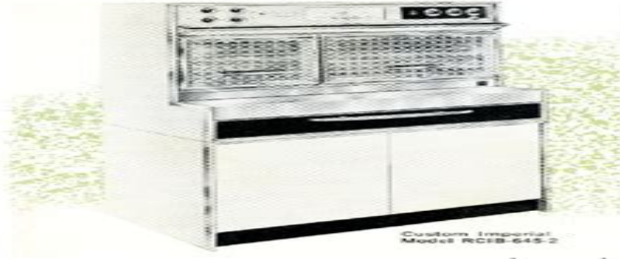
Custom Imperial Model RCIB-645-2