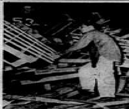
UP OVER THE RUINS OF A HOUSE IN GAZA, THE ARAB VILLAGE NEAR THE ISRAELI BORDER.