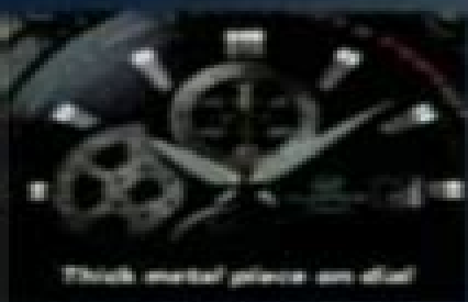
Thin metal plate on dial