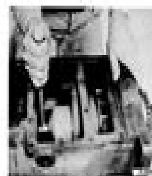
Figure 10 - Removing the 74 shaft support shaft

7. Remove the 4 separator from the transmission drive shaft bearing cage. The 74 pin can not be removed when the cage.