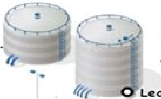
Water storage tank