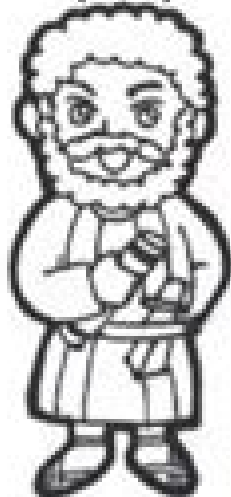
Simon (The Zealot)