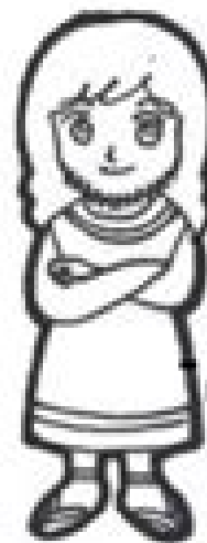
James (Son of Alphaeus)