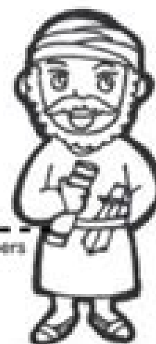
Judas (Jude, Thaddaeus, Lebbaeus)