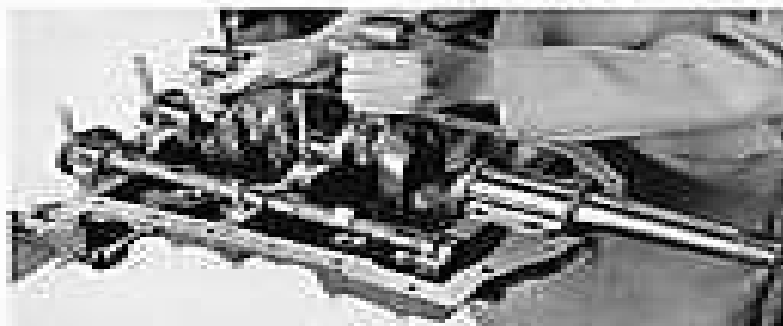
Figure 1 - Continental A-18 engine

The A-18 engine is a four-cylinder, horizontally opposed, air-cooled engine. It is designed for use in light aircraft and is capable of operating at altitudes up to 10,000 feet. The engine is equipped with a carburetor, a fuel pump, and a magneto. The engine is also equipped with a cooling fan and a water pump. The engine is designed to be easy to maintain and to operate reliably.