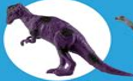
Stygmimoloch H: 3.75" x L: 5"