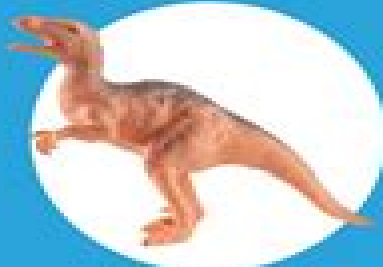
Gallimimus H: 4" x L: 5.5"