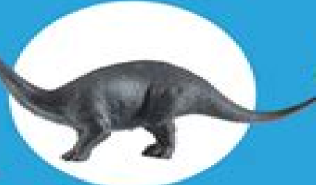
Brontosaures H: 3" x L: 6.5"