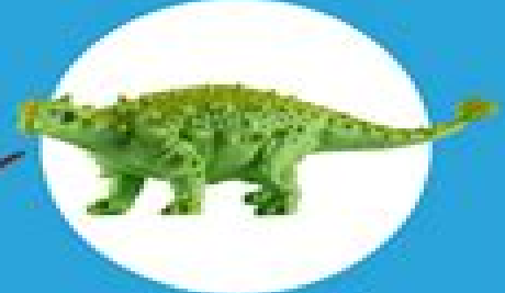
Ankilosaurus H: 1.5" x L: 6"