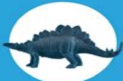
Stegosaures H: 2.5" x L: 5.5"