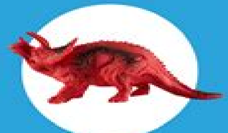
Triceratops H: 2.25" x L: 5.5"