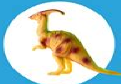
Parasaurolophus H: 4" x L: 5.5"