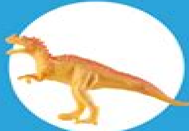
Allosaures H: 4" x L: 5.5"