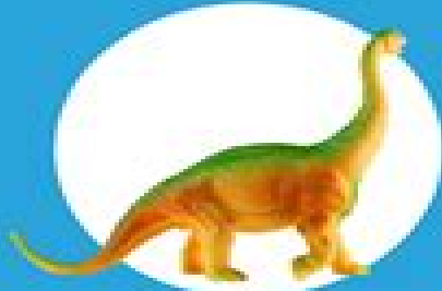
Diplodocus H: 4" x L: 5.5"