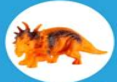
Triceratop Prorsus H: 2.25" x L: 5.5"