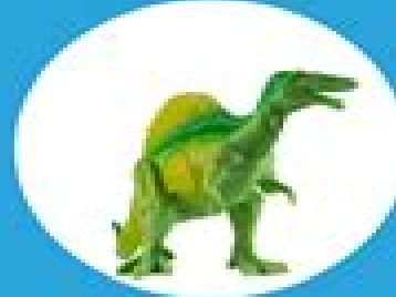
Spinosaures H: 3.5" x L: 5"