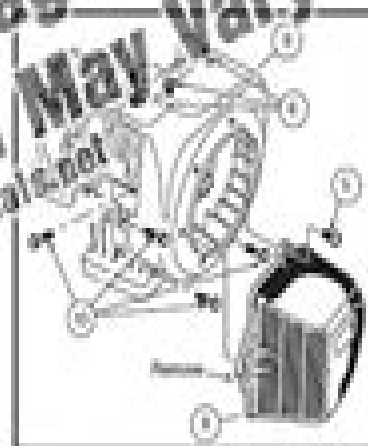
Figure 14-25 Fan Housing Removal