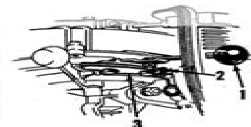
Fig. CL1-3—Speed control lever and synchronizing cam showing points of adjustment.

To adjust the float level on carburetors shown in Fig. CL1-2, the carburetor should be removed. Remove the