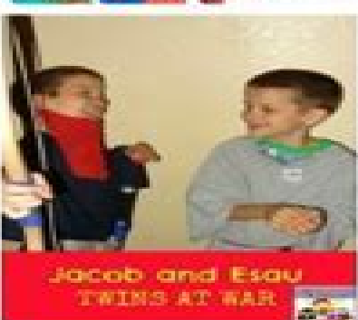
Jacob and Esau TWINS AT WAR