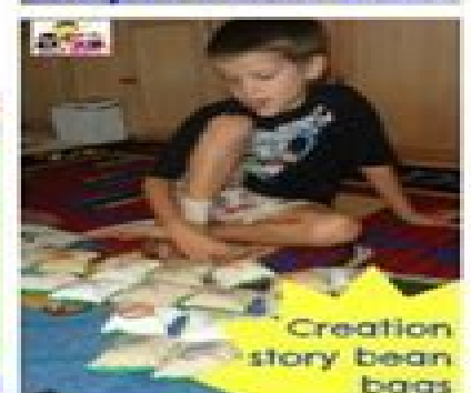
Creation story bean bags