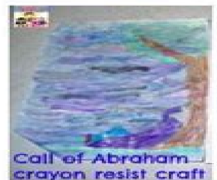
Call of Abraham crayon resist craft

from "In the Beginning" to Joseph's big reveal