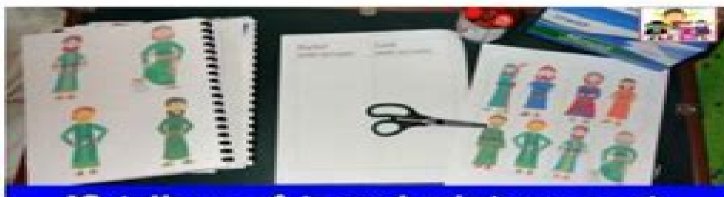
10 craft projects for Genesis lessons