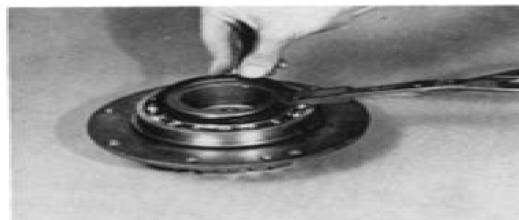
4. Remove snap ring from hub of auxiliary drive gear; press retainer ring and bearing from drive gear.