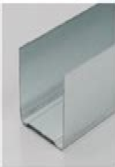
NP U profil 45