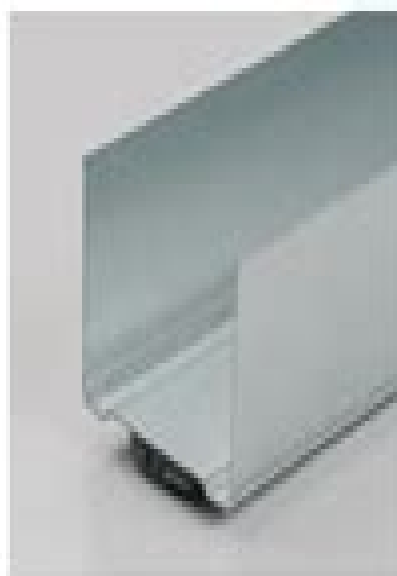
NP U profil 45 F