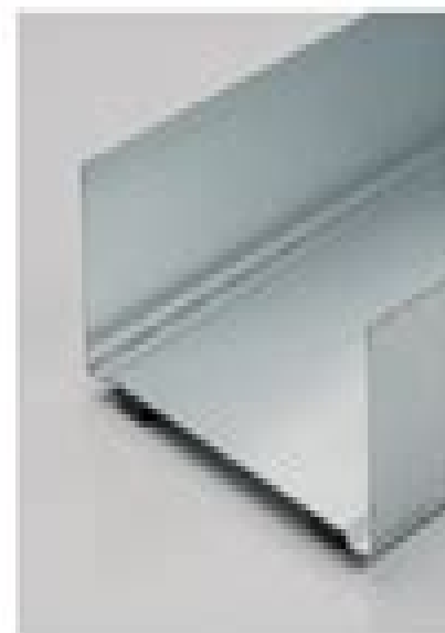
NP U profil 100 F