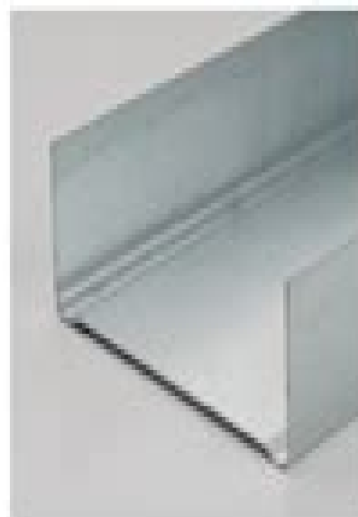
NP U profil 100