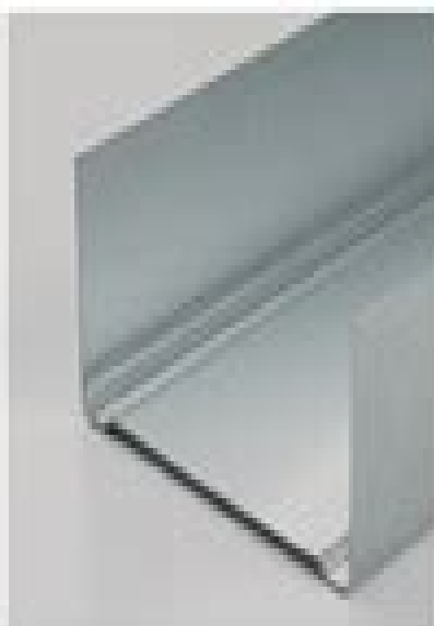
NP U profil 75