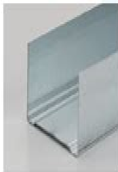
NP U profil 50