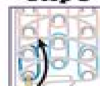
Grab the blue band on the left pin