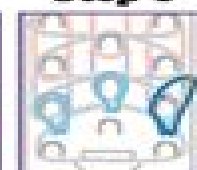
Loop the blue band straight up to the next pin

Step 7: Continue picking up and looping the bands until you reach the top of the loom. Finish the bracelet with a white extension and C-clip. (see reverse)