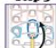
Grab the blue band on the center pin