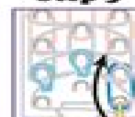
Grab the blue band on the right pin