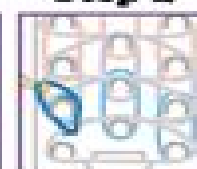
Loop the blue band straight up to the next pin