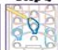
Loop the blue band straight up to the next pin