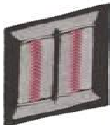
© 2000 Blackwell Science Ltd, Journal of Internal Medicine 247: 395–401 All rights reserved. No part of this publication may be reproduced, stored in a retrieval system, or transmitted, in any form or by any means, electronic, mechanical, photocopying, recording, or by any information storage or retrieval system, without permission in writing from Blackwell Science Ltd.