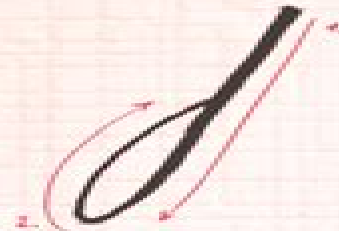
8. DESCENDING LOOP