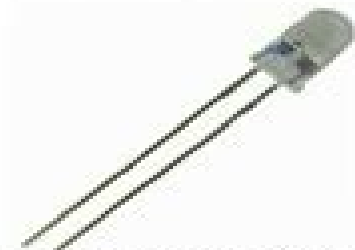
Light Emitting Diode