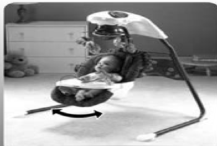
Cradle (Seat moves side to side)