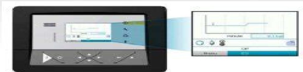
Real time trending

The superior processing capability of the Elektronikon® Mk5 enables a compressor of almost any age or type to benefit from the latest and most advanced control algorithms and functionality, resulting in improved system control and energy savings.