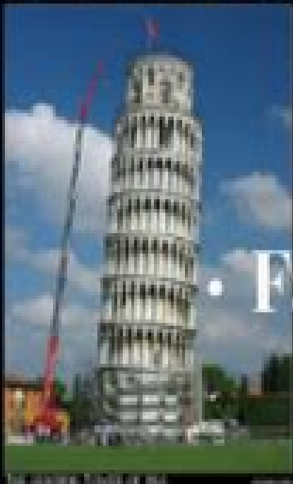
The Leaning Tower of Pisa