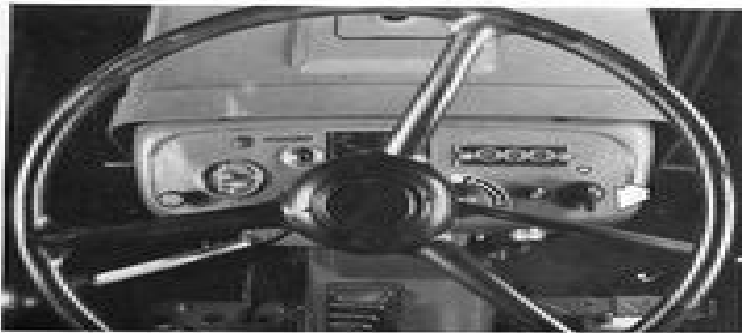
Figure 7 — Hand Throttle