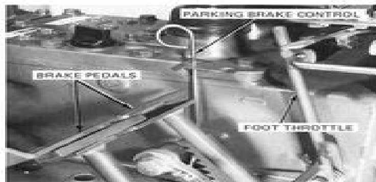
Figure 8 — Parking Brake

The parking brake control, shown in Figure 7, is used for locking the brake pedals in the applied position. The parking brake should be applied whenever the tractor is parked, Figure 8.