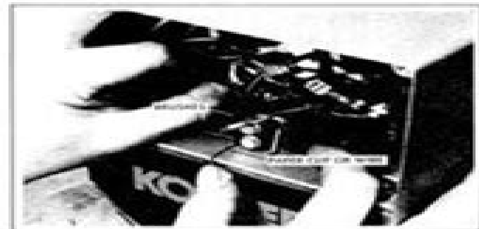
Figure 2-14. Raising Brushes