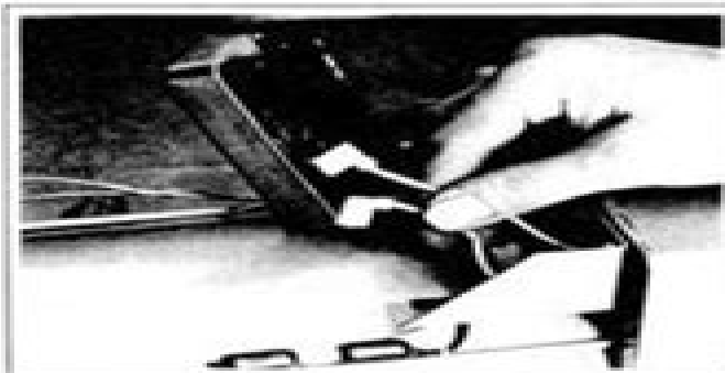
Figure 2-12. Removing Regulator