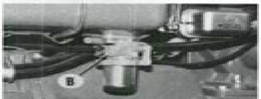
Fig. 11—View of fuel filter and air bleed screw (B).