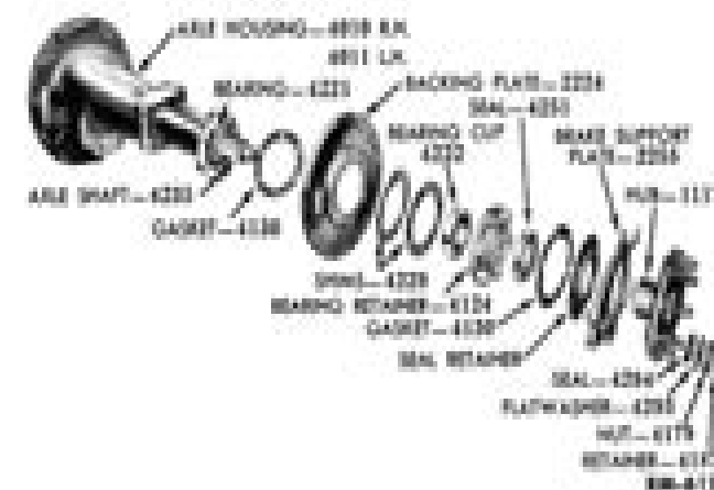
Fig. 34—Backing Plate and Hub, Disassembled

Place the axle housing assembly on a bench, and remove the lock ring that secures the axle shaft nut. Remove the axle shaft nut, flat washer, and seal. Remove the cap screws that secure the differential gear case to the axle housing. Separate the two halves. If necessary, use a hammer to tap the two halves apart. Remove the differential spider, together with the differential pinions and thrust washers, from the differential gear case (fig. 35). Remove the differential side gears and thrust washers.