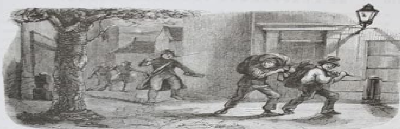
DE KLAPPERMAN VAN 'S GRAVENHAGE.